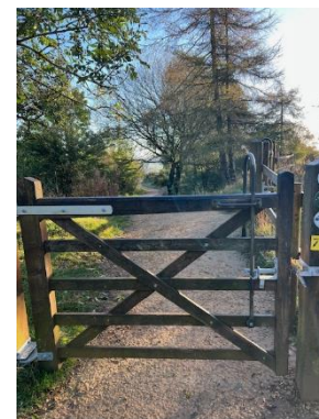
Image shows pedestrian gateway out of the carpark.

Image shows pedestrian and vehicle gateway on a gravel track.