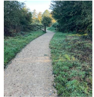
Image shows path back in carpark at end of the route.

Image shows a compacted gravel path with puddles.