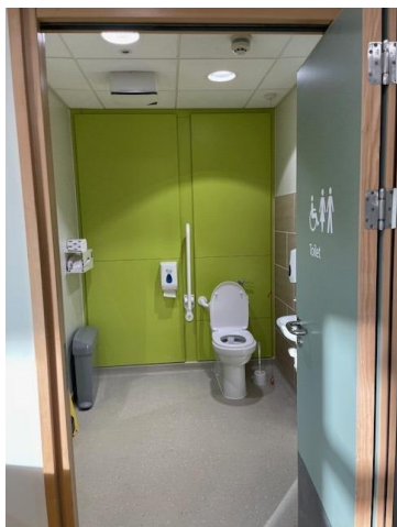
Image shows bathroom with toilet and door opening inwards. There are grab rails and the sink is on the right hand side.

Facilities: There are fully accessible toilets within the Anderson Building. One has a ceiling hoist system but you will need to bring and use your own sling. Our staff and volunteers will not be able to provide help with personal care and hoisting.