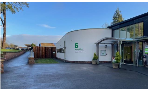
Image shows main reception area at National Star where event registration will be taking place. There is a slope down from the car park.